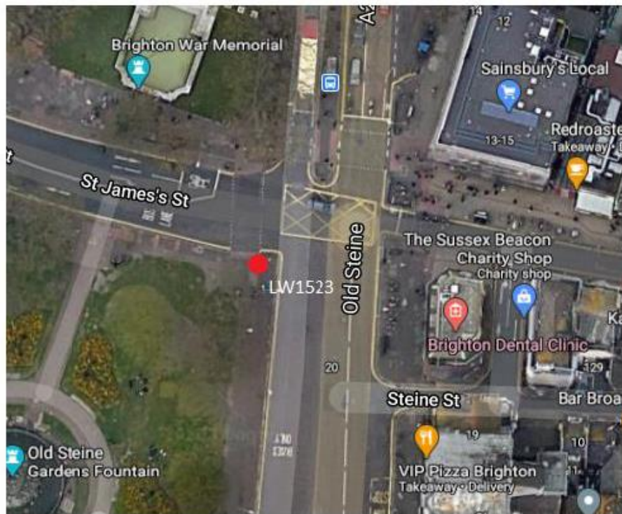
● Westbound Rear - Facing Camera LW1523